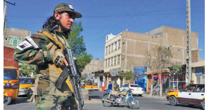
AP ■ HERAT (AFGHANISTAN)